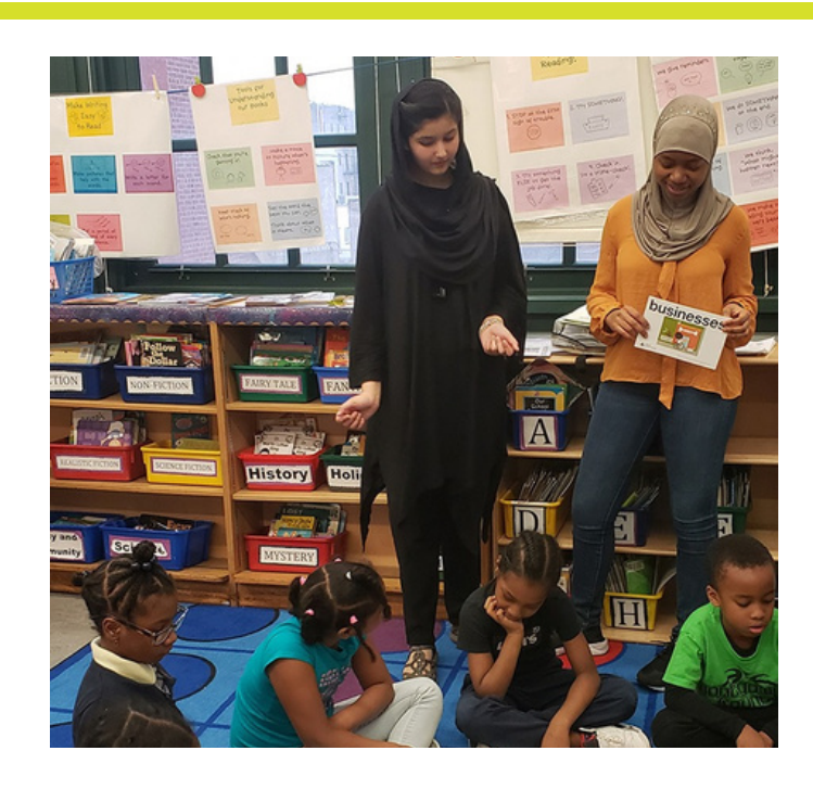
High School Heroes from Brooklyn Academy of Science and the Environment taught over 300 K-5 students at PS 161 The Crown School.