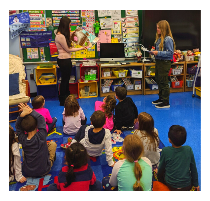
High School Heroes from Tottenville High School brought JA programs to over 300 K-2 students at PS 3.